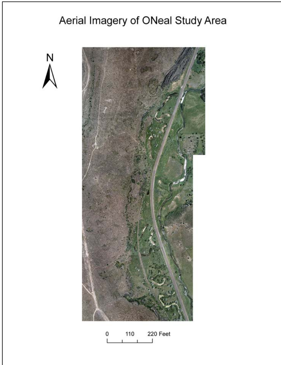
Figure 2: Aerial imagery of ONeal Study Area

Upon completion of this project the aerial imagery (figure 2) was successfully co-registered and delivered. Pre-grazing ground truth data is available, and the study area is fenced, ready for grazers.