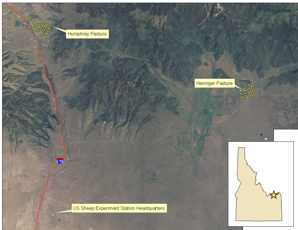
Figure 1: US Sheep Experiment Station, Humphrey and Henniger pastures.

The 2008 sampling effort focuses upon the Humphrey and Henniger pastures at the U. S. Sheep Experiment Station (USSES) near Dubois, Idaho (Figure 1). The Humphrey pasture consists of 2,600 acres of land near Monida, Montana and is used for spring, summer, and autumn grazing and rangeland research. The Henniger pasture consists of 200 acres of land near Kilgore, Idaho, and is used for summer grazing and rangeland research. Mean annual precipitation (1971 to 2000) at the Dubois Experiment Station ( 112^{\circ} 12' W 44^{\circ} 15' N , elevation, 1661 m) is 331 mm with 60% falling during April through September. Soils are mapped as complexes of Maremma (Fine-loamy, mixed, superactive, frigid Calcic Pachic Argixerolls ), Pyrenees (Loamy-skeletal, mixed, superactive, frigid Typic Calcixerolls), and Akbash (Fine-loamy, mixed, superactive, frigid Calcic Pachic Argixerolls) soils on slopes less than 20 percent, but mostly 0 to 12 percent (NRCS 1995). Vegetation on the study sites are sagebrush-grassland communities dominated by mountain big sagebrush ( Artemisa tridentata ssp. vaseyana [Rydb.] Beetle) and threetip sagebrush ( A. tripartita Rydb.).