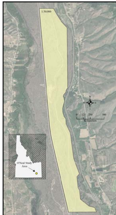
Figure 1. Research study area: The O'Neal Ecological Reserve, represented by the polygon, is located near McCammon, Idaho.

The site is characterized by shallow, well drained soils over basalt flows originally formed from weathered basalt, loess, and silty alluvium that remain homogenous throughout the site (USDA NRCS 1987; Weber and Gokhale 2010). Dominant plant species include big sagebrush ( Artemisia tridentata ) with various native and non-native grasses, including Indian rice grass ( Oryzopsis hymenoides ) and needle-and-thread ( Hesperostipa comata ) (Weber et al. 2010). The O'Neal is managed by Idaho State University (ISU) while land immediately surrounding it is managed by the USDI BLM. This area has a history of rest-rotation cattle grazing (> 20 years) at low stocking rates (300 AU/ 1467 ha [6 AUD ha -1 ]). Prior to ISU management, no fences existed to restrict movement of cattle from the adjacent USDI BLM grazing allotment to the O'Neal study area. In 2005, the site was fenced providing areas of grazing and total rest. The last fire to occur within the O'Neal was in 1992.