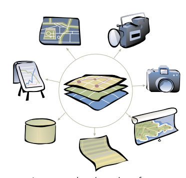
Integrate data in various formats and from many sources using GIS.

GIS takes the numbers and words from the rows and columns in databases and spreadsheets and puts them on a map. Placing your data on